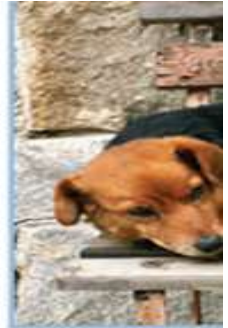
▲ Some dogs and